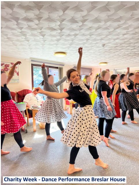
Charity Week - Dance Performance Breslar House