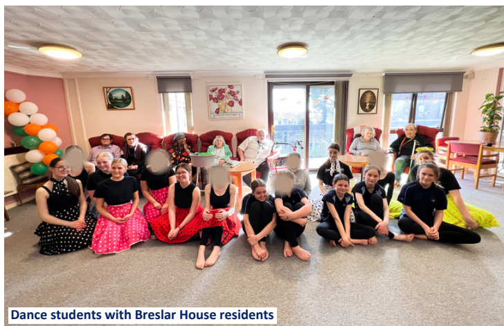
Dance students with Breslar House residents