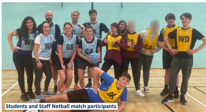
Students and Staff Netball match participants

A huge well done to all the students and staff involved in the charity netball match and thank you to all the students who donated and came to support a 7-0 victory for the staff.