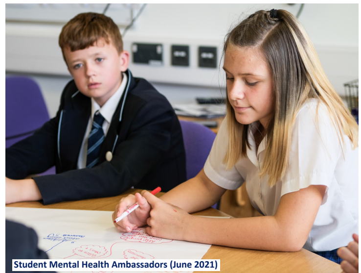
Student Mental Health Ambassadors (June 2021)

We look forward to moving forward as an academy with this award and increasing our student's and staff's wellbeing.