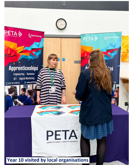
Year 10 visited by local organisations