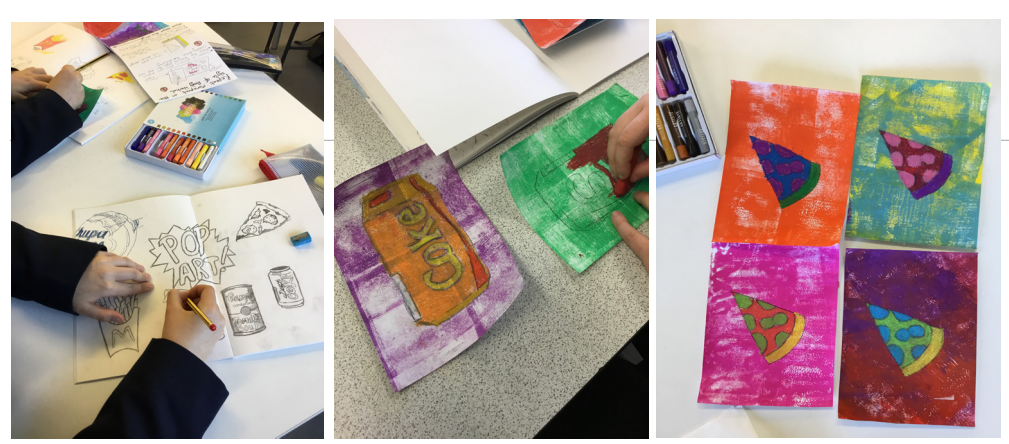
Year 9 students have been using inspirational foods such as pizza and chips as well as coca-cola cans to create their artwork this week.

Year 9's have been creating Andy Warhol inspired food prints for the Pop Art project. They have been learning how to identify contrasting colours on the colour wheel to create eye catching repeat designs.